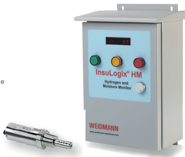
Optional moisture-in-oil sensor package